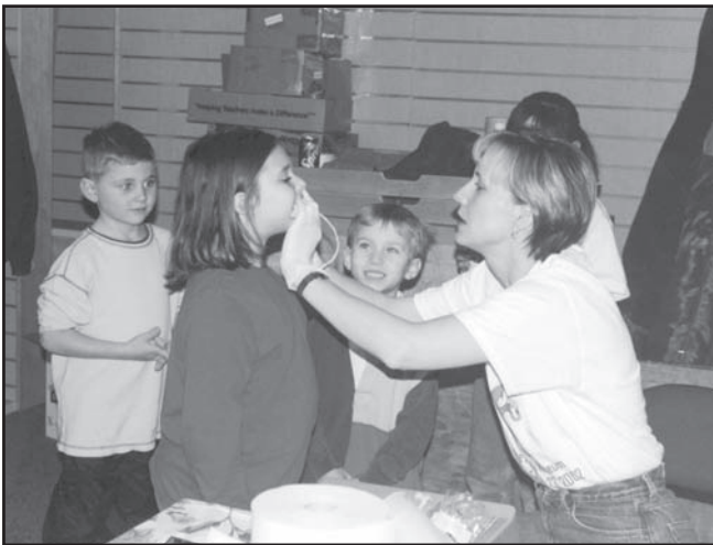
Fitting a mouthguard is a popular stop on the "tour".