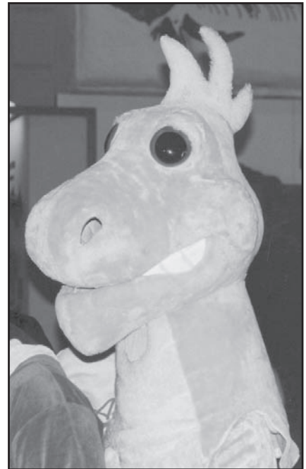
Dudley the Dinosaur