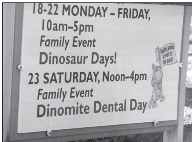
Healthy smiles are out of this world.