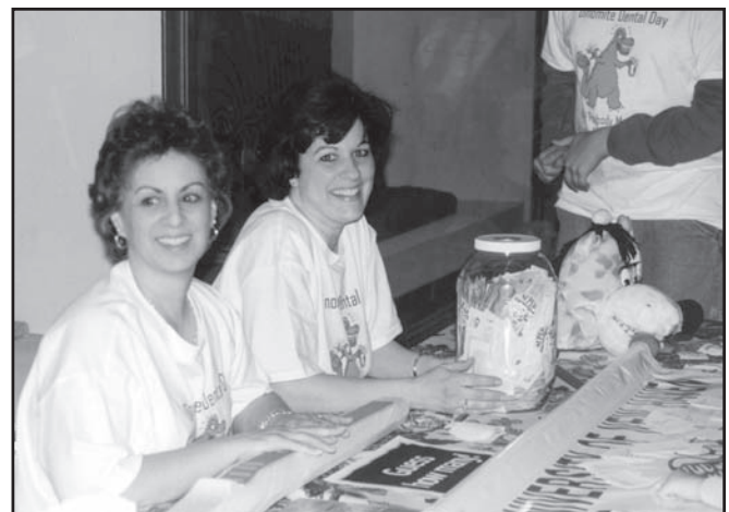
Many volunteers work hard to make Dinomite Days a success.