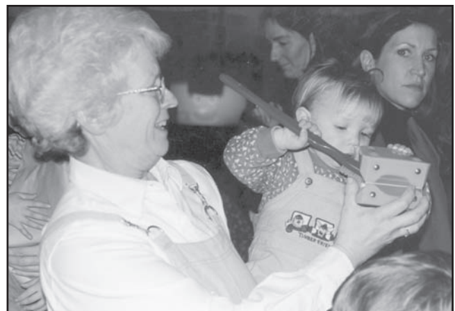
Learning to Brush, Continues . . .