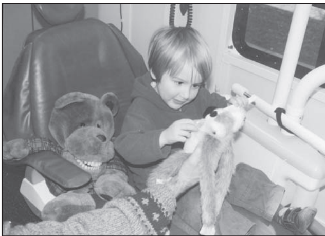
Learning to Brush