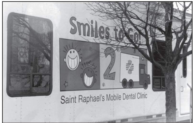
The Famous "Smile Mobile"